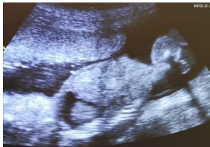
Figure 1. Obstetrical ultrasonography indicates bilateral pleural effusion at 18-week 3-day POA

she gets 150mg intramuscular Medroxyprogesterone every 3-month as family planning.