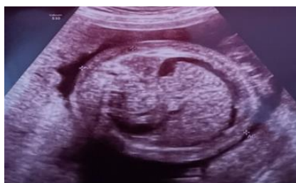
Figure 2. Obstetrical ultrasonography indicates fetal ascites and thick abdominal wall at 28 weeks POA