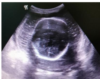
Figure 4. Obstetrical ultrasonography indicates fetal scalp oedema at 24 weeks POA