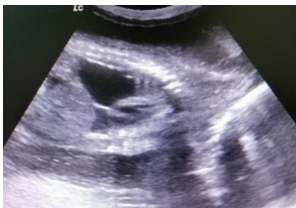
Figure 3. Obstetrical ultrasonography indicates fetal bilateral pleural effusion, left more than right side, where left massive pleural effusion pushing left lobe of lung and the heart to the right thoracic cavity, no pericardial effusion, both lungs hypoplasia at 24 weeks POA