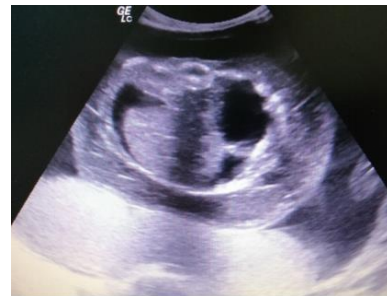
Figure 5. Obstetrical ultrasonography indicates fetal ascites at 24 weeks POA