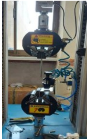
Figure1. Sample mounted on the device

Finally, the data were analyzed SPSS 20 using T-test at significant level of P < 0.05 .