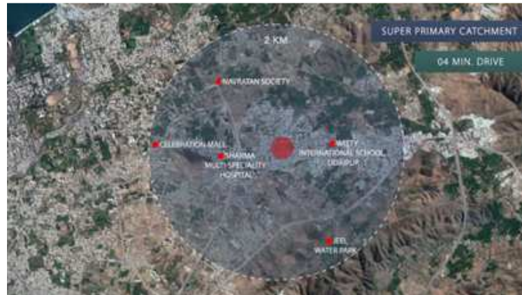
Figure 8: Primary Catchment – 04 Min. Drive.

Located at Sukher, Urban Square mall is just 9 km away from the old city and the prominent Lake Palace hotel, around 5 km from Sukhadia Circle which is a well-known local attraction and less than 3 km from the road that leads to the tourist attractions of Ranakpur, the city known for its world famous Jain temples and Mount Abu, the hill station of Rajasthan (Google Maps, 2020).