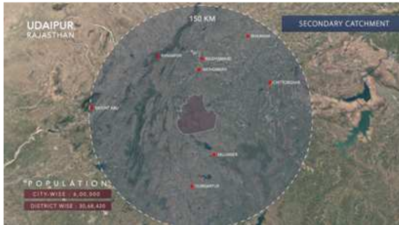
Figure 5: Secondary Catchment – 150 Kilometers.