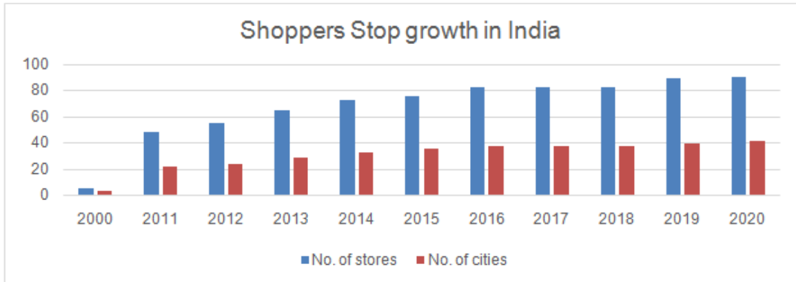
Figure 3: Growth of Shoppers Stop Stores in India (Shoppers Stop, 2020).

Shoppers Stop is one of the largest retail chains of large-scale departmental stores in India established in 1991 by K Raheja Corp. It includes multiple categories like apparel, accessories, home furnishings and decoration. It is one of the rare companies that is run by professional managers while most of the retail companies are run by entrepreneurs. It has 90 stores and retail floor space of approximately 4.5 million sq. ft. across 42 cities in India (Shoppers Stop, 2020) (Financial Express, 2020) (Knight Frank, 2017). It is the only Indian member of the International Department Stores Group (IGDS), along with 29 other established retailers from around the world (Knight Frank, 2017).