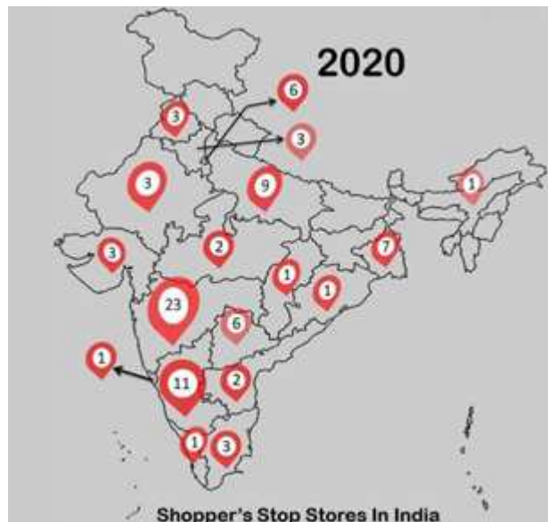
Figure 4: Shoppers Stop Retail Stores Spread Across India (Shoppers Stop, 2020).

The figure shows spread of Shoppers Stop across India and it is seen that the distribution of departmental stores is quite dense in few locations while it is minimal in some locations. 43% of the departmental stores are located across three states covering five cities. The company has been selling off its loss-making businesses and shutting down the loss-making stores to reduce the losses and clear out its debt. The company is also re-structuring and re-sizing its stores to improve its performance (Financial Express, 2020).