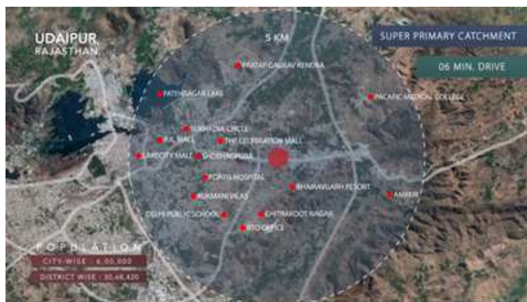
Figure 7: Super Primary Catchment – 06 Min. Drive.