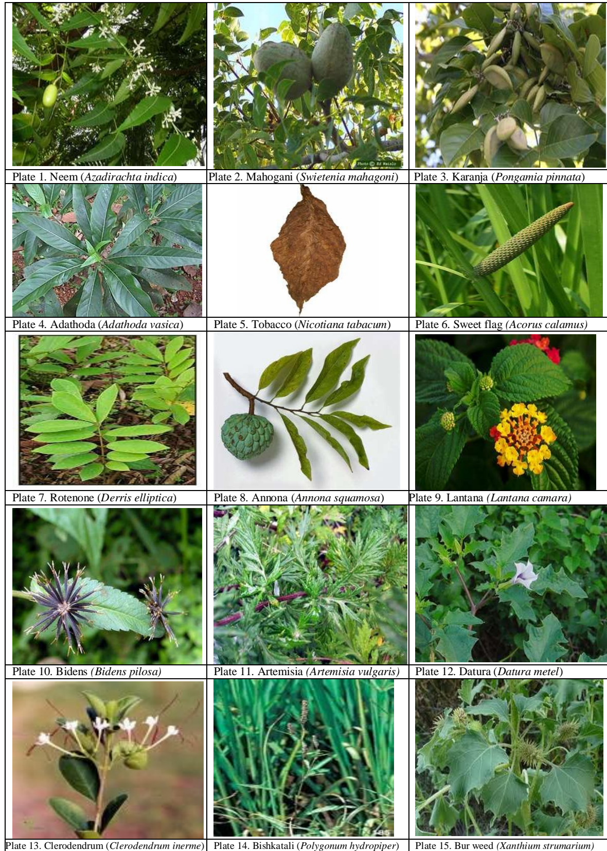
Fig.1. Some potential plants useful in tea pest management