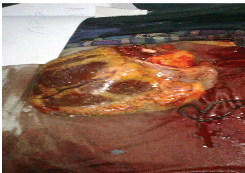
Figure 3: More than 20 m from the victim apart, a motionless bloody spherical structure which was found – the patient's heart.