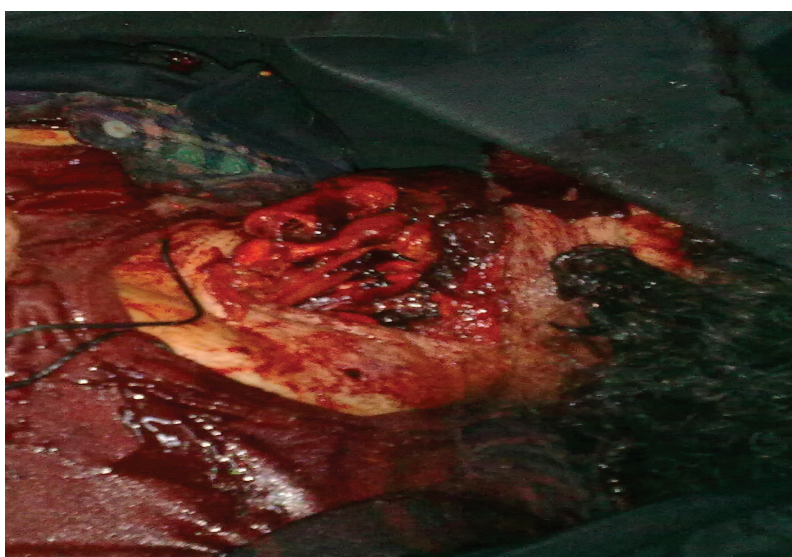
Figure 2: 12 cm open wound at the jugulo-sternal base of the neck (zone 1) with no active bleeding.