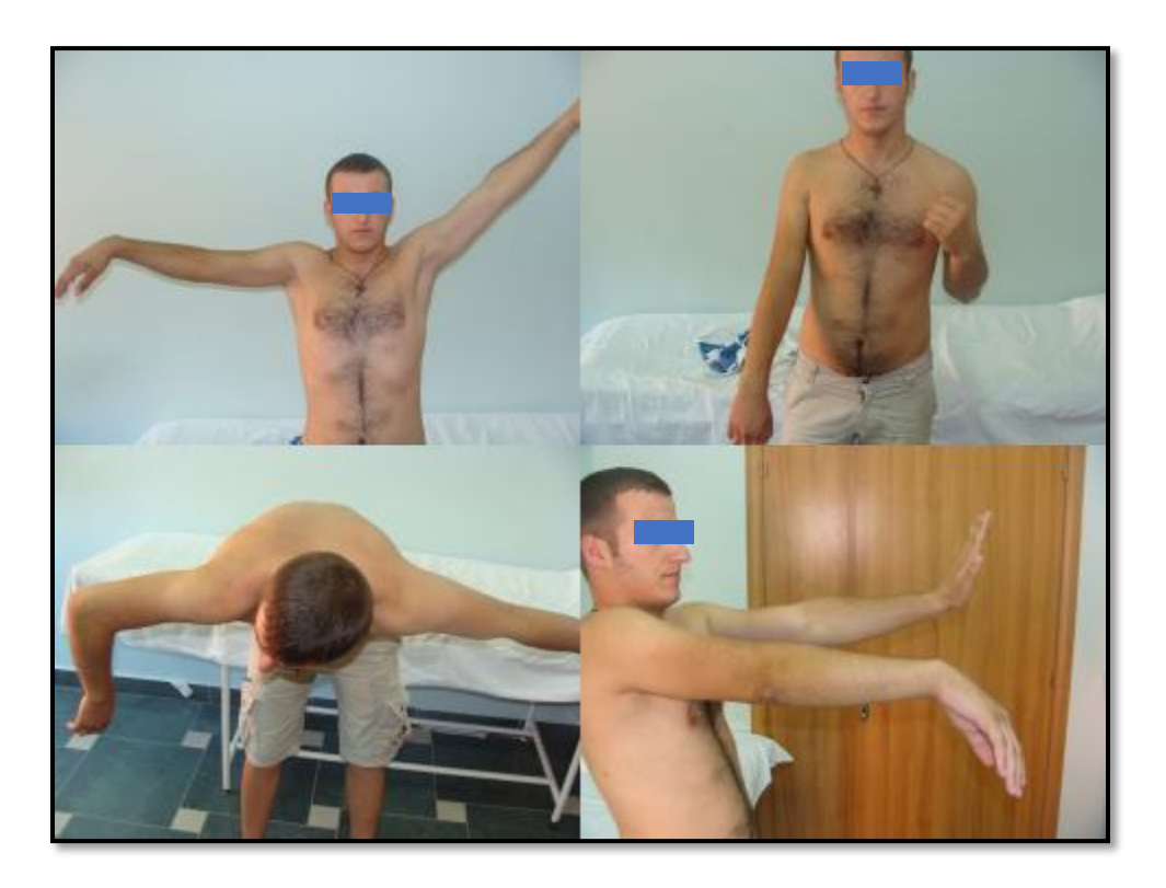
Figure 2: Complete palsy of the radial, median ulnar and musculocutanues nerves.