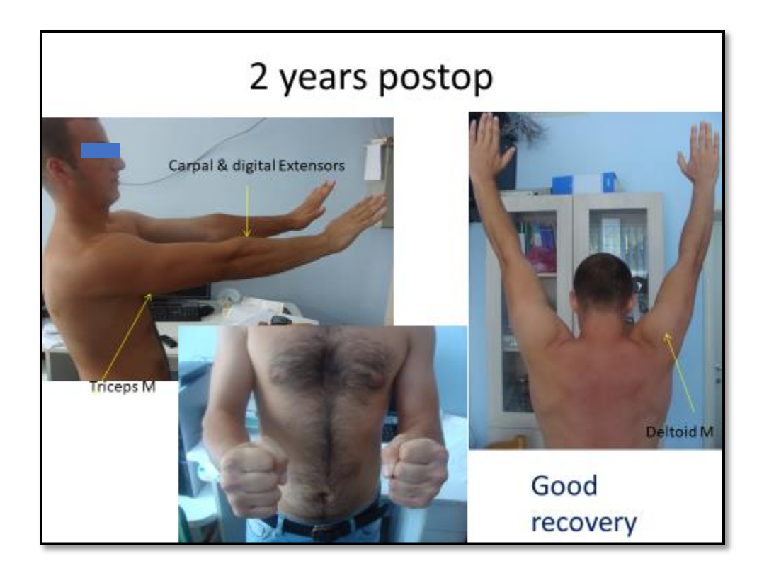
Figure 5: Two years after surgery full neurological recovery.