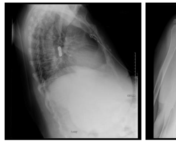
Figure 7 - Two buttons in the esophagus (lateral view)