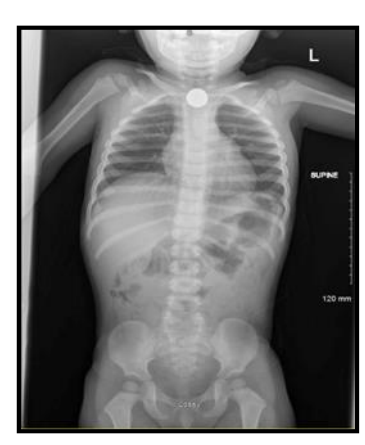
Figure 4 - Penny in 2 years old esophagus

The most common blunt objects are coins in children in US and China studies, followed by bony FBs, plastic bars and iron nails (Geng, 2017). (Figures 4-8) These should all be removed if in the esophagus, within 24 hrs if asymptomatic, 2 hrs if symptomatic or a button battery. If in stomach or below, follow if asymptomatic, remove if symptomatic (ESGE).