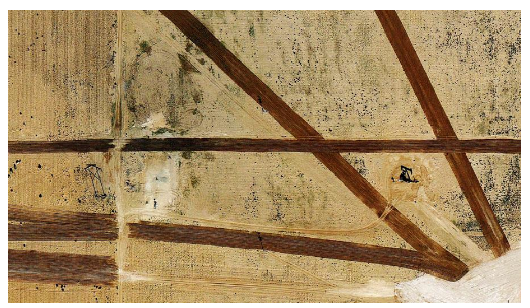
Figure 3 - Levelland Oil Field, Hockley County, Texas (detail). Photo series: "Feedlots" - Mishka Henner, 2013. Exhibition: Drone: The Automated Image - Darling Foundry Gallery, Montreal, 2013.

However, if the viewers get closer to this aerial photograph, they can verify some details of the industrial oil operation of Levelland Oil Field, USA. It is possible to recognize, for example, the appearance of electricity poles and some beam pumps: machines used to mechanically lift oil out of the ground (fig. 3).