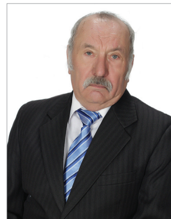
Fig. 3. Aurel Saulea, MD, PhD, Emeritus Professor

In 1994, the Department organized a symposium on sports medicine under the auspices of the International Olympic Committee of Medical Commission. In 1990-1994, the department staff participated in the organization of the Republican Center for Medical and Social Rehabilitation and conducted scientific researches in the field of gerontology and geriatrics. The department also organized an international scientific conference and four symposia on current physiology-related issues and on medical and gerontological recovery. Furthermore, the academic staff attended international congresses and conferences with original scientific reports, thus following the European and world standards of research in the field of physiology and its related fields [4, 5].