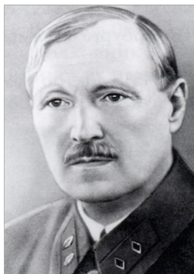
Fig. 1. V. N. Shevkunenko.

following net involvement of anatomists did not bring benefits in the direction of the studied problem and even it made this problem to be more difficult and currently only the behavior of the cervical fascia represents a difficulty for the classification and interpretation of cervical fasciae. Such authors as V. P. Vorobyov (1932) quotes the complete expression, in principal, philosophical or with moral, practical sense in a minimum of intonation of Malgain’a, which became classical: “Cervical aponeurosis – this anatomical chameleon which appears every time in a new form as the result of the nib of each person who has tried to describe it”. Even A. D. Pansch (1888) in “Essentials of Human Anatomy” said that the neck fascia is the subject of the anatomy that can be considered as being the most confused [2].