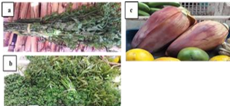
Figure 3. a. Bajei (Ceratopteris thalictroides); b. Kalakai (stenochlaena palustris); c. Jantung Pisang (Musa paradisiaca formatypica)

This acculturation has brought several food names to Balinese transmigrants namely “ makanpaku ” and “ makanjantung ” like the Dayak Ngaju usually call them. “ Makanpaku ” is a term used by Balinese transmigrants to refer to a food made of kalakai plants ( Stenochlaena palustris ) and bajei plants ( Ceratopteris thalictroides ). These plants belong to a group of ferns that grow abundantly on peatlands. “ Makanjantung ” is a term referring to a food made of the heart of banana plant as the basic ingredient (Figure 3).