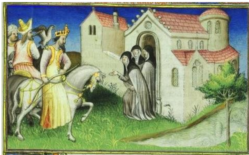
Figure 1 - A miniature from a book by Marco Polo

One of the miniatures of the manuscript depicts King David-Ulu hunting (fol. 8r) [1, p. 19]. There is a hawk or falcon on the King’s shoulder which is trained for falconry (figure -1). The miniature is made by the Master of the Mazarine . Mazarine couldn’t have been an eyewitness and could not have had any instructions from the author about the appearance and clothes of the Georgian king. Therefore, his clothes are of European style and do not look like the hunting clothing, so called “kabarcha” that the Georgian kings and nobles used to wear [3, p. 34].