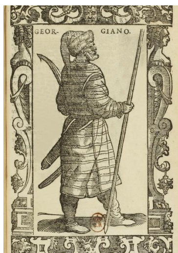
Figure 2 - Georgian – Engraving from the book of Cesare Vecelio