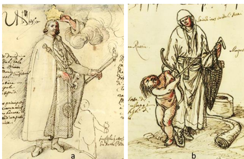
Figure 4 - Pictures from Castel's album: a - King Alexander III of Imereti; b - A peasant woman with a child