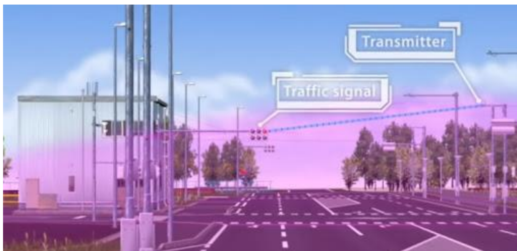
Picture 2. Smart traffic light system in Tashkent.

at the main intersections of the central cities of the regions.