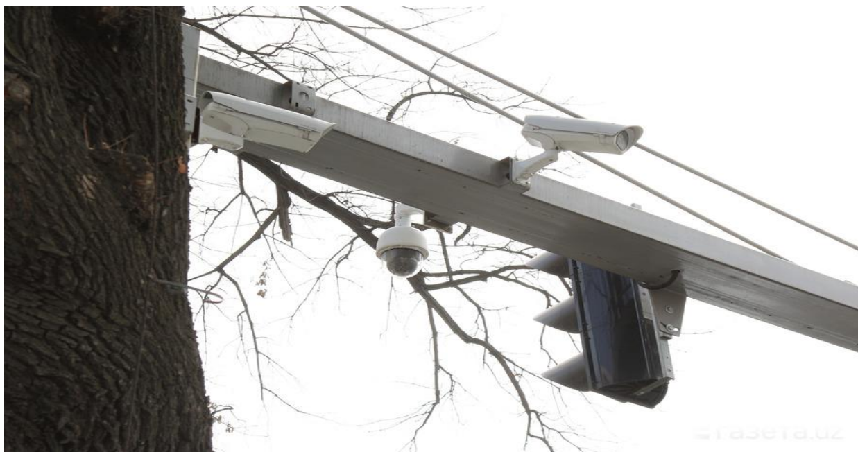
1 Surveillance camera

In this regard, to provide traffic participants with information about road conditions and situations, public transport schedules through an automated system. At the same time create applications that allow you to monitor the movement of public transport. This allows passengers to get an idea of public transport, taking immediate action in the event of a traffic accident. A number of practical steps have been taken in this regard. For example, in June 2017, two types of cameras were installed in Tashkent and later at the intersections of regional centers. One of them works in video surveillance mode and is installed to monitor the streets and intersections, while the other detects violations on the roads, sends information about the offending driver to the database and imposes administrative sanctions on him. serves to apply. According to the program, by 2021, all intersections and central streets of Tashkent will be 100% camera-controlled.