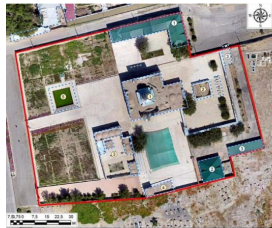
Fig.3. Pockets. Kashim Sheikh House 16 th century General view and history