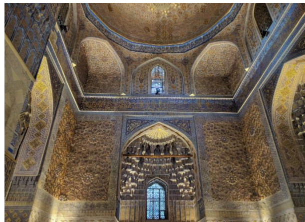
Fig.2. Bukhara. Complex Chor-Bakr XVI century. General view and interior

Another unique masterpiece built in Karman at that time is the Kasim Sheikh complex. Qasim Sheikh