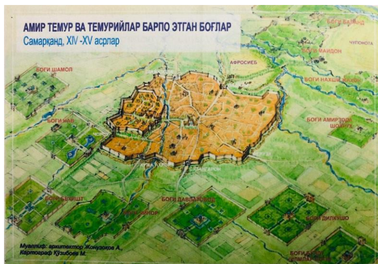
Fig 3. Timurid Gardens in Samarkand (Chaharbagh).[13, 5-6-p]

example, in the booklet there are about 14 gardens, A. Uralov noted in his brochures that they outlined their location and graphic reconstruction. [3, 27-28-p]