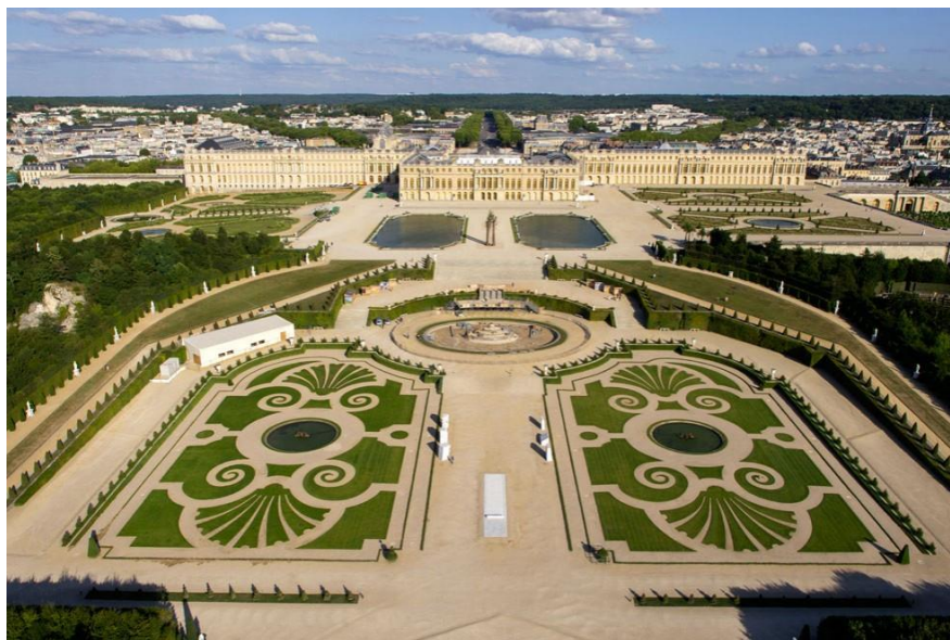
Fig.2. Palace of versailles

solution, and they are still recognized by architects. Many of the later palace designs were also built to the standards of these palaces.