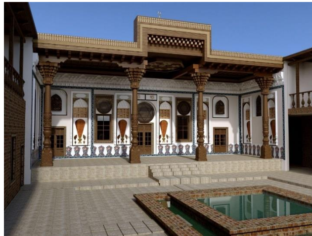
Fig.4. Graphic reconstruction of Charmgarbog in Karmana.

The garden is one of the most beautiful and planted with unique flowers and plants from around the world.