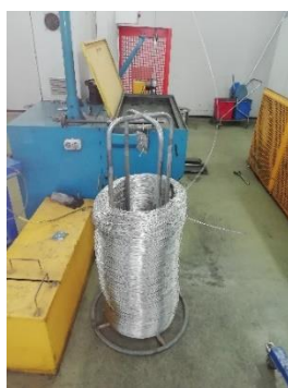
Figure 1 – The coil with strip plate for drawing of wire on the machine of Chinese production.

Wire drawing was performed with additional processing (steam, water) and without it. The workpiece is wound on the vertically arranged coil. The workpiece is moved from the coil to the equipment of Chinese production through a roller of a looper. A signal is sent to a control panel and drawing stops on the machine in case of the loop formation. The workpiece is pulled through seats with the installed dies and wound on the driving and driven drums. The several dies with the different diameters of the working holes are installed in the device. Wire drawing occurs in the special bath, which is filled with liquid. Plastically deformed nichrome wire is wound on the horizontally arranged coil through the range of the guide and bypass rollers. This technology does not allow to remove internal stresses in wire material. Therefore, wire breaks are possible, which are eliminated by welding on the special welding machine.