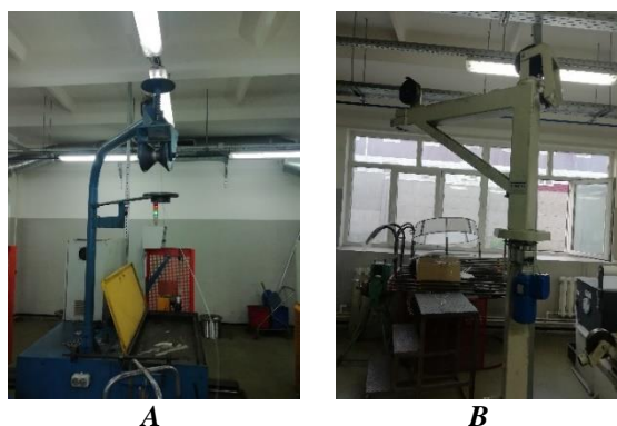
Figure 2 – The loopers: A – the drawing machine of Chinese production; B – the drawing machine of Italian production.