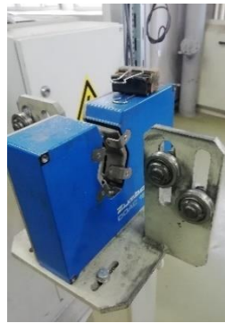
Figure 7 – The laser device for measuring of the diameter and the oval of wire.