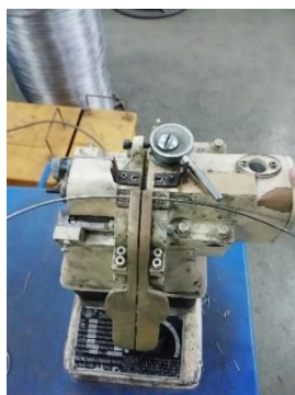
Figure 11 – The welding machine.

Additional processing of wire with hot and cold water, steam and air under high pressure in the special baths is feature of drawing on the equipment of Italian production. Control of a geometric shape of processed nichrome wire is carried out on the special laser device. Possible warping of wire after drawing is eliminated on the straightening mechanism.