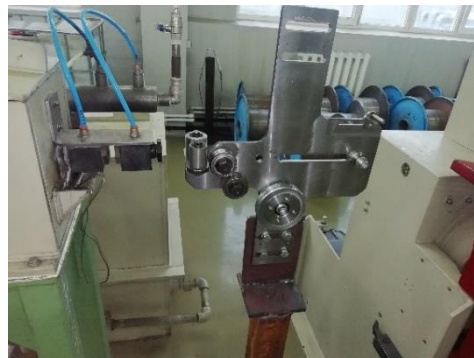
Figure 9 – The straightening mechanism.