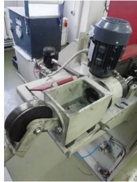
Figure 3 – The guide roller of the drawing machine of Italian production.