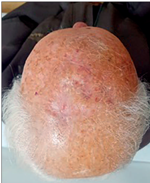
Fig. 2. Postoperative aspect 12 months after the reconstructive surgery.

According to the specialized literature, the incidence of the squamous cell carcinoma is increasing worldwide. Statistics in the United States show that the risk of occurrence of this condition during lifetime is between 9 and 14% for men, while for the female population the values vary between 4% and 9%. Annually, United States report between 200,000 and 400,000 new cases of squamous cell carcinoma,