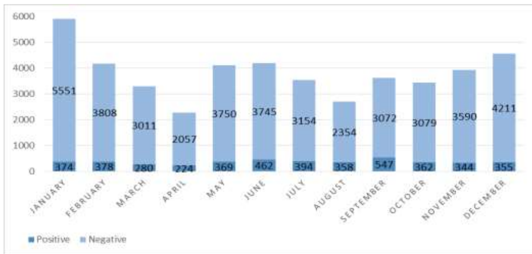
Fig.1. The positive and negative cases of intestinal parasites in the referrals of each month in three medical centers in Masjed Soleyman