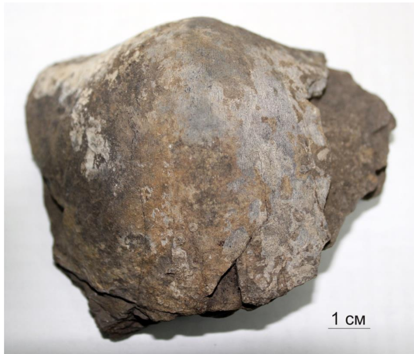
Fig. 4. Brachiopod, C 1 , Ilych River. Collected: V.A. Varsanofyeva. 1924. No. 153/2. Funds of A.A. Chernov's Geological Museum.