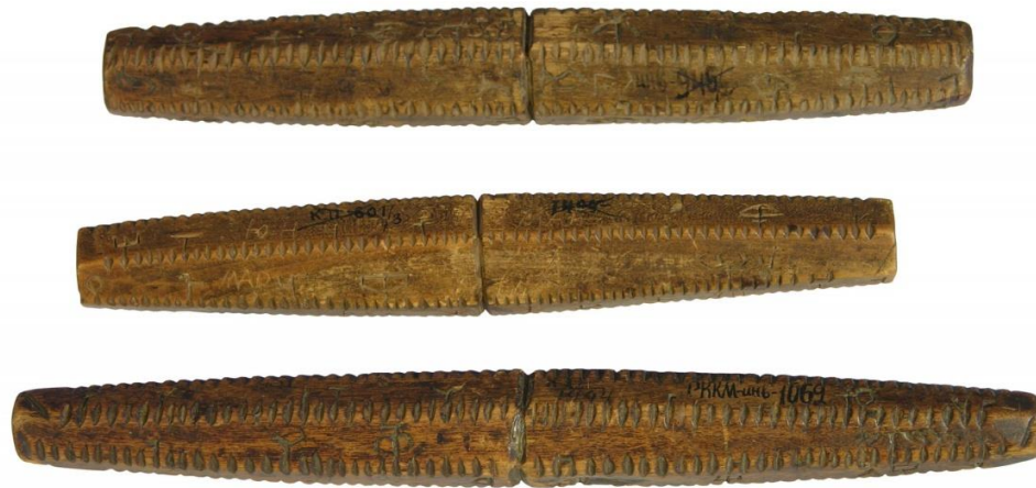
Fig. 6. The Komi calendar “pu svyatsi” [26, Lipin V.B.].

Scientists studied not only the religions and beliefs of the local population, but also their influence and manifestations in family and social life, revealed the role of one or another religious movement in the formation of the cultural and everyday specifics of a particular ethnographic group. For example, T.A. Dobrolyubova, in 1924, having visited the Shchugor River, stopping for the night in one of the huts, describes the difficult fate of a girl from Ust-Shchugor, who married an Old Believer. Old-believing customs did not allow her to sing and dance songs, wear shirts, outfits, and bras.