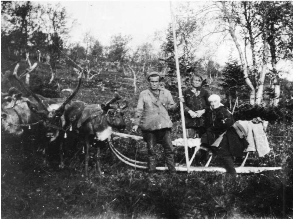
Fig. 3. Varsanofyeva V.A. (sitting) with guides on Ust-Ilych (1920s).

Geologically, in the basin of Ilych, a complete section of Paleozoic sediments from ancient crystalline shales to Permian carbonate rocks were identified, which gave a general idea of the geological structure of the western slope of the Northern Urals. Varsanofyeva V.A., in the veins of the southeastern part of Kychil-iz, found the presence of iron luster and copper ore, on the northern slope of Kozhim-iz - ocher deposits, used by locals to paint sledges and household items. In the southern part of Man-Khan-Kham, locals discovered smoky quartz. Lead ores of Shatym-Priluka were studied, exploration of which was carried out in 1911 by mining engineer N.I. Erassi.