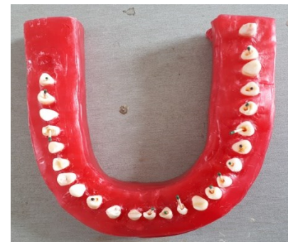
Fig.2 mounting teeth in the U-shaped wax rim.

Radiographic examination: The CBCT scans were obtained using denture scan mode of Newtom 5G System (QR srl, Verona, Italy) set at 110kv and a tube current of 3.46 mA and a mean time of 4.8 seconds with an FOV of 18x16 cm and a voxel size of 0.3 mm. The scans were examined in three planes of axial, coronal and sagittal in multi-planar reformation (MPR) by using NNT viewer software version 3.0 (QR srl, Verona, Italy). The slice thickness was 0.5 mm in this study. Scans were examined by two trained endodontists twice with two-week interval for the presence or absence of a horizontal root fracture (figure 3). The observation was done in a low-light room with the LG Flatron 18.5 inch monitor (LG, Seoul, Korea) and observers were free to choose magnification. In addition, the observers were unaware of how many samples had fracture.