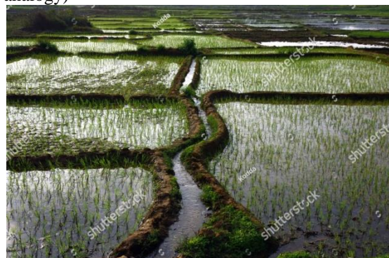
Figure.5 Kedaara-kulyanyaya (field and channels for irrigation analogy)

To substantiate the Sukradharakala (mucous membrane of testis) which pervade the entire body in all living beings by an analogy - like ghee present in milk and jaggery present in the sugarcane juice 20 .