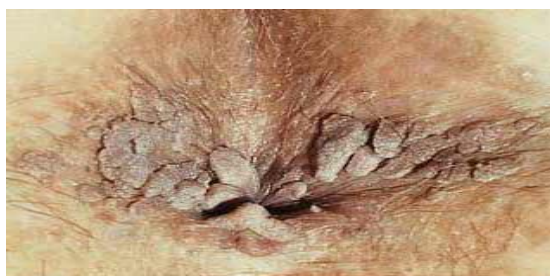
Figure 12 Vatajaarshas

(Fig.13) and tundikerinadi mukula 25 . Pittajaarshas (Fig.14) similar to liver, tongue of parrot bulged in the middle 26 (Fig.15). Kaphajaarshas (Fig.16) resemble Karira , panasaasthi (seed of jackfruit) (Fig.17), or gosthana (udder) 27 Rakthaja Arshas resembles the sprouts of Nyagrodha , coral and kakananikaphala (rosary pea) 28 .