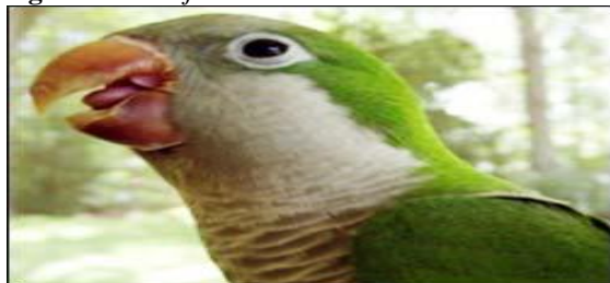
Figure 15 Tongue of parrot bulged in the middle