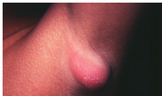
Figure 18 Pittaja abscess

Pittaja abscess (Fig. 18) resembles the ripen fruit of Udumbara 29 (Fig.19). Kaphaja abscess is saucer in shape 30 .