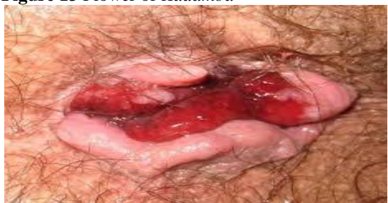
Figure 14 Pittajaarshas