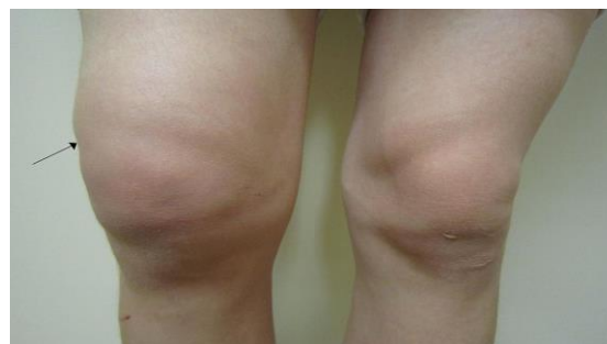
Figure 24 Krostuka Sirsaka

Upamanapramana to help the physician correct diagnosis with an ease. Krostuka Sirsaka (Fig.24) is a disease, resembling the head of a Kroshtuka (Jackal) (Fig.25) in shape 45 .