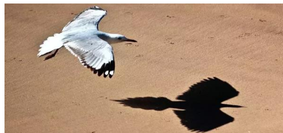
Figure 1 A flying bird leaves its shadow during day time, likewise the dosha can't evade its role in making disease

– there is no time in the day a flying bird can leave its shadow 13 (Fig1).