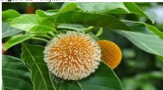
Figure 13 Flower of Kadamba