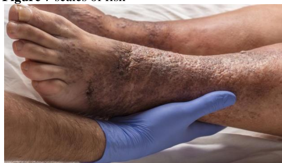
Figure 8 charmakushta (type of skin disease)