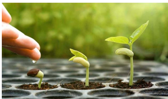
Figure.2 Germination of seeds with proper rthu (season), kshetra (place), ambu (nutrition) and beeja (seeds)

fertilization give birth to a good progeny. This concept was explained by a simile – by the suitable season, field, water and seeds are required all together for the production of good yield 17 (Fig2). The development of all major and minor parts of foetus simultaneously, because of minuteness they are not perceptible – the upamana used here is just like in the sprout of bamboo tree and mango fruit. In ripen mango fruit its fibres, flesh, seed and kernel are seen separately with the passage of time, where as in a young fruit they are not seen separately due to their minuteness 18 .