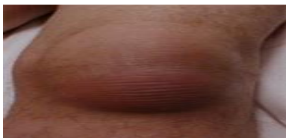
Figure 20 Sandigatavata (osteoarthritis)

(inflammatory swelling), the swelling resembles to the movement of an air-filled bag when it palpated by the fingers of physician 32 . In sandigatavata (osteoarthritis) (Fig.20), the palpation on the swelling resemble to the palpation on an air-filled bag 33 (Fig.21). In Udakodhara (ascites) (Fig.22)- symptom on palpation senses like a water filled bag 34 (Fig.23).