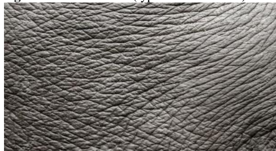
Figure.9 skin of elephant