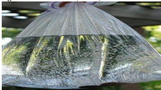
Figure 23 A bag filled with water