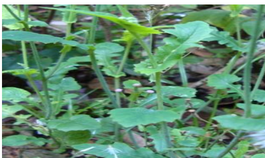
Figure 26 Sasakarnee

In both Dravyaguna and Rasashastra-Upamanapramana is used as the name of many plants are indicated as similarity. For identifying the plants by the similarity in their names. Akhukarnee – the leaves are like the ears of rat. Sasakarnee (Fig.26) – like ear of rabbit (Fig.27). Aswagandha – it smells like horse.