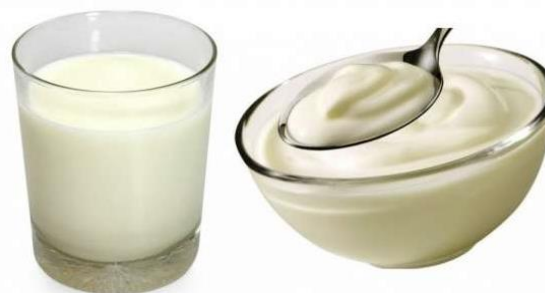
Figure.3 Ksheera-dadhinyaya (milk-curd analogy)

receiving their shares of cereals from the same barn and irrigation of large field through channels, respectively 19 .