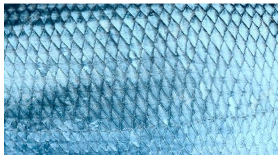
Figure 7 scales of fish