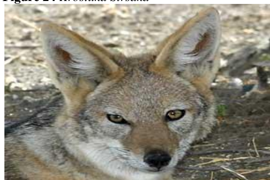
Figure 25 Head of a Jackal

Sopha swelling at the root of the lower jaw slightly painful, immovable, related to hard stones i.e. Pashanagardabha 46 , Black spots of the size of tila (sesame) seen anywhere on the body known as tilakalaka 47 . An eruption sound ( Pidaka ) like Vidarikanda known as Vidarika 48 . A severe disease like