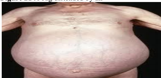
Figure 22 Udakodhara (ascites)