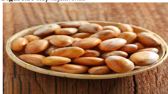
Figure 17 Panasaasthi

Pittaja abscess (Fig. 18) resembles the ripen fruit of Udumbara 29 (Fig.19). Kaphaja abscess is saucer in shape 30 .