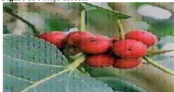
Figure 19 Ripen fruit of Udumbara Sparsana (Palpation)

In pakwasopha (chronic swelling), the movement of pus inside the swelling is like the movement found in a bag filled with water 31 and in pachyammanasopha