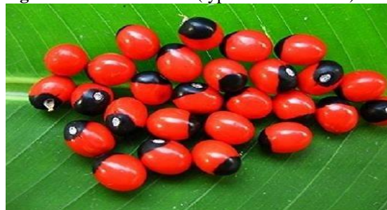
Figure 11 Rosary pea

The Vatajaarshas (piles) (Fig.12) resembles like the flower of Kadamba