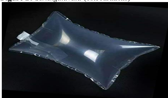
Figure 21 A bag distended by air