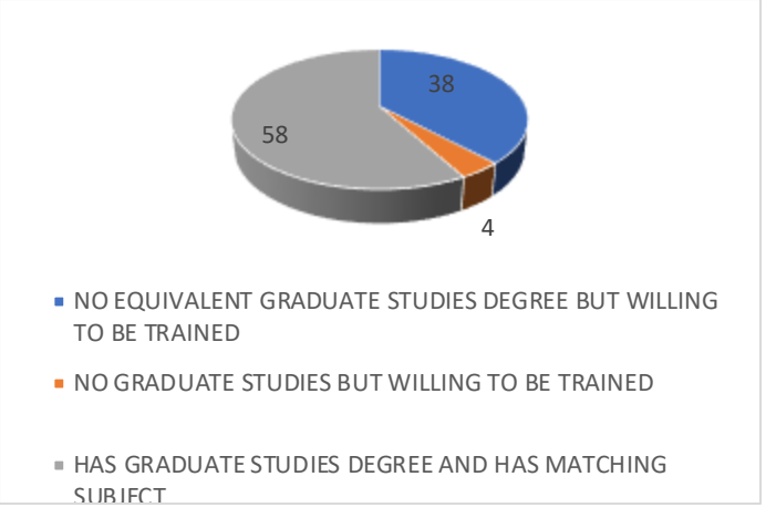
Figure 3. Summary of CAS faculty qualification for possible HRD intervention (In percentage)

Looking at Figure 3, it is evident that 58% of the CAS faculty has equivalent graduate degree studies and so very much qualified to teach the corresponding new General Education course/s. Of the 24 teachers, 4% have no graduate studies and 38% has no equivalent graduate studies degree of which both groups (totaling to 42%) are willing to be trained.