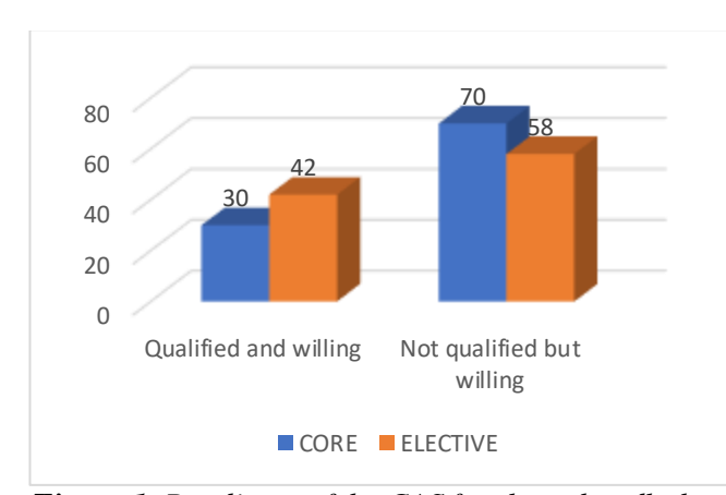
Figure 1. Readiness of the CAS faculty to handle the new General Education courses.

The result revealed that of the 24 teachers, 30% are qualified to teach the core subjects and there are 70% who are not qualified but are willing to handle some of the subjects. For the Elective Courses, 42% are qualified and 58% are not qualified but willing to teach.