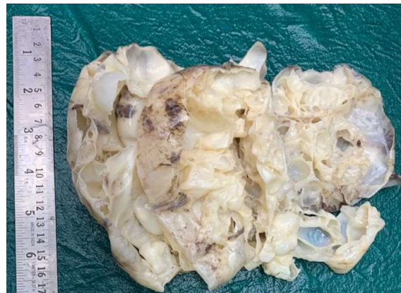
Fig. 3. Cut section of specimen showed multilocular cystic kidney filled with clear fluid and no solid nodular area.

Histopathological examination showed multiloculated cysts lined by flattened