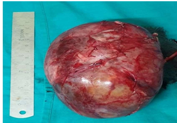
Fig. 2. Gross photograph of total the left nephrectomy specimen.

Normal bowel sounds were heard. There was no hepatosplenomegaly and ascites. His complete blood picture and renal function tests were within normal limits. Ultrasound showed unilateral multilocular cystic mass of left kidney of 10x9x10 cm and normal right kidney which was confirmed by CT abdomen. Child underwent left sided nephrectomy under general anesthesia (Fig. 2). Grossly, cut section of kidney showed multilocular cysts filled with clear fluid (Fig. 3).