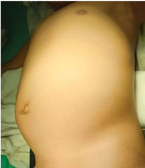
Fig. 1. Preoperative photograph of infant with left lumbar region mass.

A 1 year old male child born to non-consanguineous parents was brought with complaints of painless palpable abdominal mass for 3 months. The lump was initially smaller in size and gradually progressed to the present size. There was no history of hematuria, fever and difficulty in passing urine. There was no family history of renal disease or renal mass. There was no history of anomalies in antenatal ultrasonogram and postnatal period was uneventful with no neonatal intensive care unit (NICU) admission. The child was active, playful and alert during examination. Head to toe examination was normal with no evidence of dysmorphism or associated congenital anomalies. Vitals were within normal limits. There was no pallor, fever, lymphadenopathy or pedal edema. On abdominal examination, a well circumscribed mass of size 9x9 cm was palpable in left lumbar region bimanually which was mobile, firm, nontender and ballotable (Fig. 1).