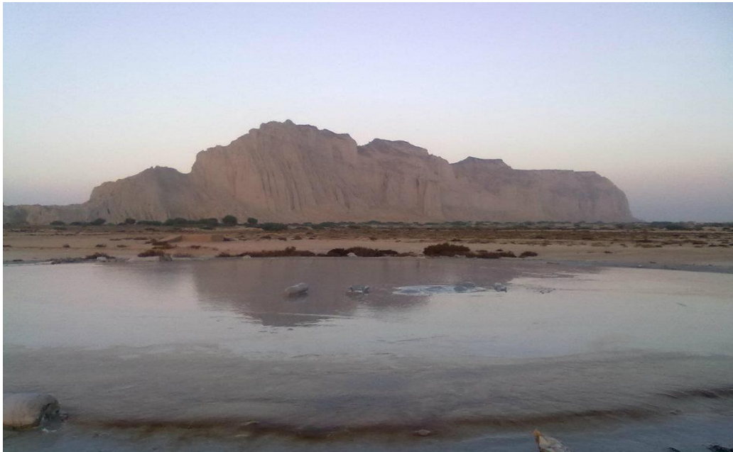
Figure 2: Illustrates a close-up view of Gwadar mud volcano.

It is located nearby Gwadar city (Delisle et al., 2002) (Fig. 2). The area sheltered by the focal mud volcano is approximately 0.11 ha and crater diameter ranges from 1 to 7 m. A total of two mud volcanoes have been recognized which exemplifies no activities (Kassi et al., 2013).