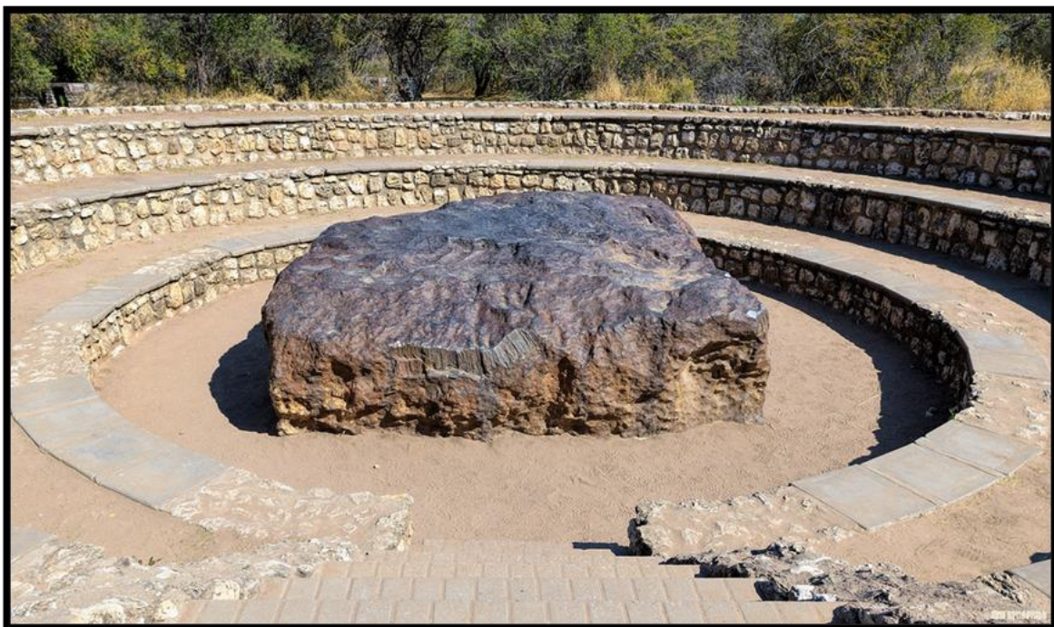
Figure 1: World's Largest Meteorite, Hobba Meteorite

A meteoroid is a sand- to boulder-sized particle of debris in the Solar System which collides with the Earth. The visible path of a meteoroid that enters Earth's (or another body's) atmosphere is called a meteor, or colloquially a shooting star or falling star [1]. If a meteoroid reaches the ground and survives impact, then it is called a meteorite [2]. Many meteors appearing seconds or minutes apart are called a meteor shower. The root word 'meteor' comes from the Greek meteōros, meaning "high in the air" [3]. A meteorite is a solid piece of debris from an object, such as a comet, asteroid, or meteoroid, that originated in outer space and survived its passage through the atmosphere to reach the surface of a planet or moon. ... For geologists, a bolide is a meteorite large enough to create an impact crater. Therefore, a 'Meteorite' is a rock in the Solar System which collides with Earth and survives impact. (Figure 1.).