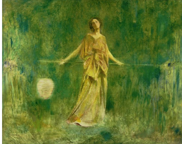
Thomas Wilmer Dewing (1851 - 1938)

Symphony in Green and Gold 1912 Oil on panel