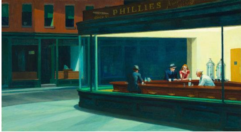
Edward Hopper (1882-1967)