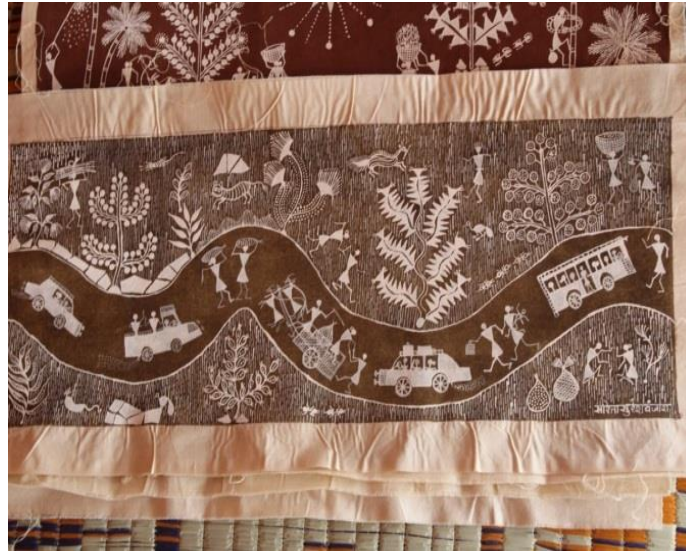
Figure 1.1: Changed form of painting by Sarita Suresh Vanjara from Ganjad, Dahanu, Maharashtra

Introduction of the new modern motif of airplane, car, school building, factory are not necessarily a conscious effort to make art more commercial but rather a reflection of the changing world of the artists and to make painting more consumer- related.