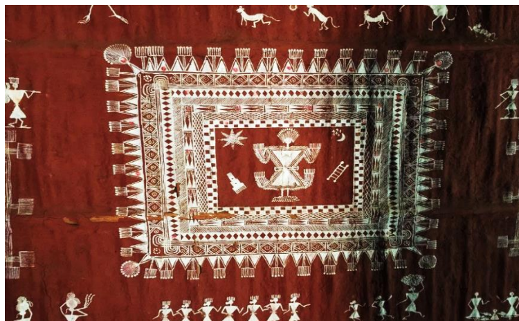
Figure 1: Painting in the house of Balu Ladkya Dumada, Ganjad, Maharashtra

The background of the painting has been changed from mud walls to paper and fabric and other for the especially for exhibitions. Also, the medium of the painting changed accordingly from rice paste and bamboo twig to poster color and brush. In the Gujrat region at few places, it was found out that nowadays they have started using lime paste and paintbrush instead of the bamboo sticks.