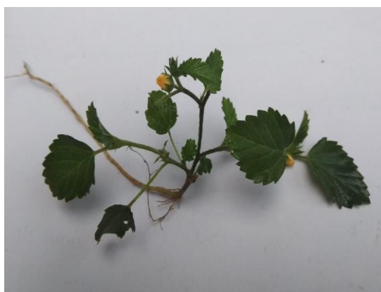
Malvastrum coromandelianum (L.) Gracke.

There are critical phase which confines population and ecological life cycle of plant species. The viability, dormancy and conditions essential for germination, set the major limits to the evidence of the species population in different seasons and habitats. It is tempting to assume that the very existence of specificity of variety of germination regulating system and their recurrent complexity that they are eco-physiological adaptation, which increase the potential for the survival of the species, and which have been formed in the normal outline of evolution (Sen, 1976).