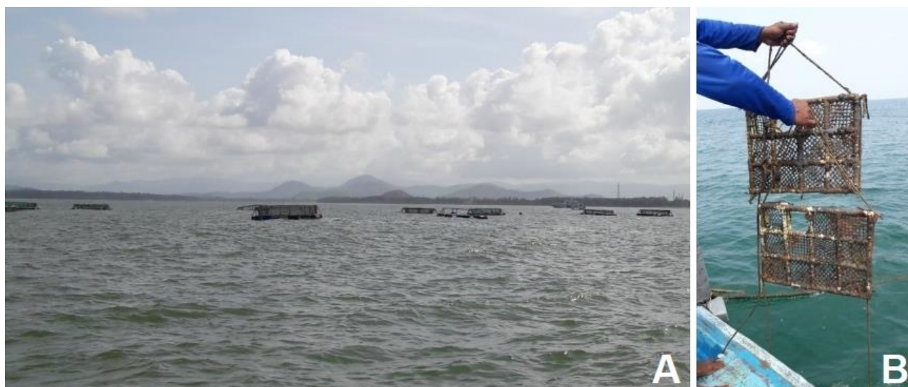
Fig.1. A : Cage farm of Karwar where the panel experiment was conducted, B: Experimental panels designed for biofouling studies