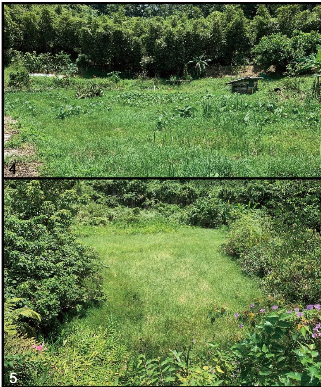
Figures 4–5. Habitats of Stenus alumoenus Rougemont, 1981, S. flavidulus paederinus (Champion, 1924) and S. frater Benick, 1916. 4, Wanggu Village; 5, Lingjiaoliao.