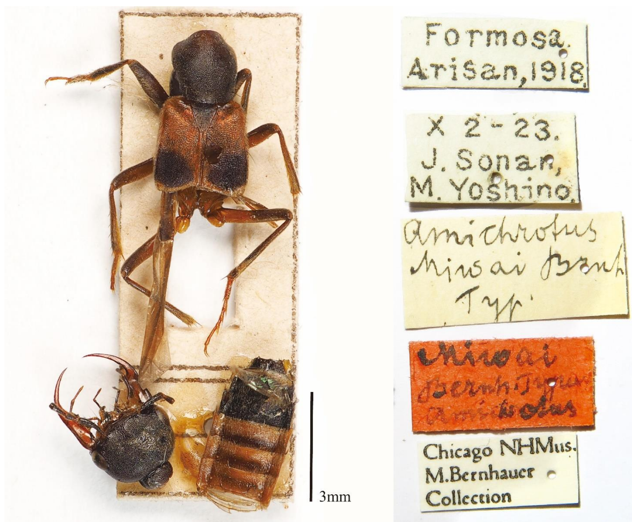
Figure 1. Type specimen and labels of Amichrotus miwai Bernhauer, 1943.

A series of H. miwai specimens were collected from Jiananyun Peak, Yunlin County (23.6037, 120.7246) by the fourth author. These specimens were found inside decaying bamboo (Fig. 2D). Two males and three females were collected at the same time: see ‘Additional material’ below for details. Both observations suggest that H. miwai presumably has a close association with decaying plant material.