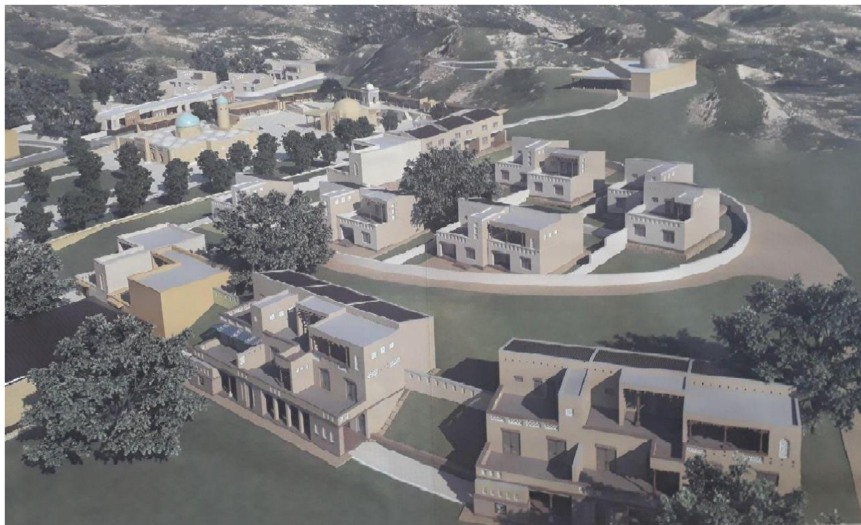
Pic. 2. The expecting appearance of the shrine after the reconstruction “Chashma” in Navoi region Nurata district.

In the course of the renovation 2005-2015 this zone was enlarged up to 2.0 hectares in around of “Chashma”. Due to the 2017-2018 projects, it will be reconstructed once more, frantically total 15.0 hectare area will be flourished. And also playgrounds, boulevards, traditional houses are expected to be built. (Pic. 2).