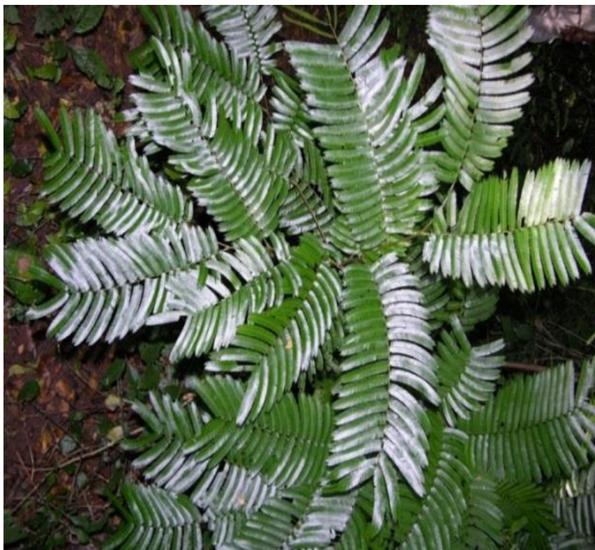
Figure 1 - Leafy twigs of Piptadeniastrum africanum

obtained for each bacterial strain are given in Table 1.