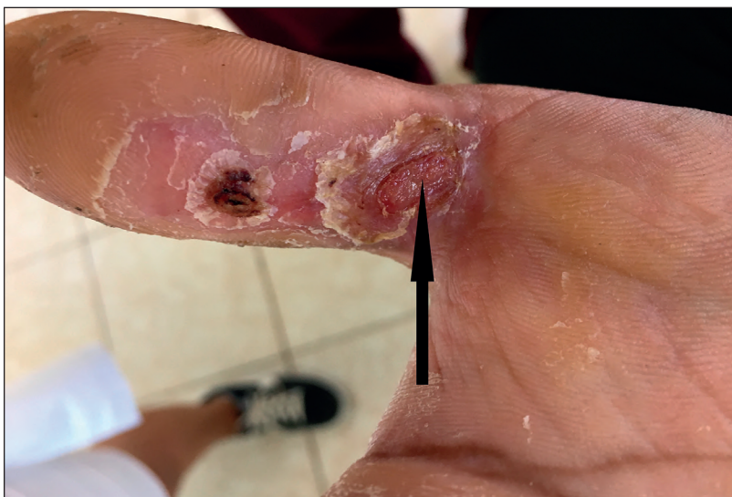
Figure 2. The 3 rd degree burn site a week after the treatment with Theresienöl.