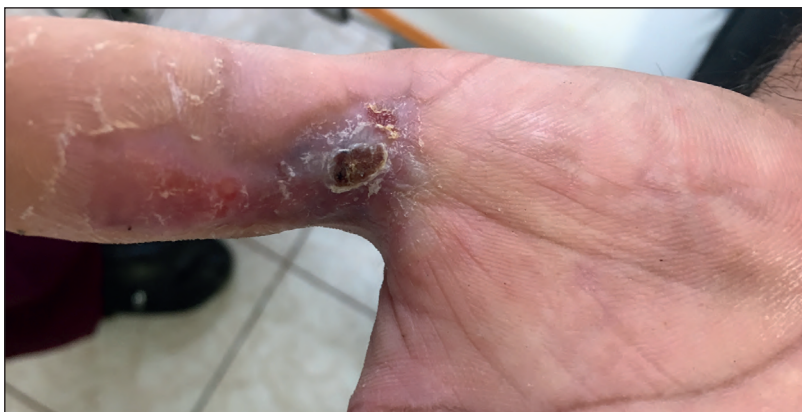
Figure 3. Completely healed wound after 14-day treatment with Theresienöl.

Postoperatively, local, antiseptic treatment with silver dressings for about 14 days was applied. We noted unsatisfactory healing, with presence of suppurative exudate in the wound bottom, and decided to move on to local treatment with 2 drops of Theresienöl once daily, covering the site with wet gauze, to avoid the oil soaking in (Fig. 1).