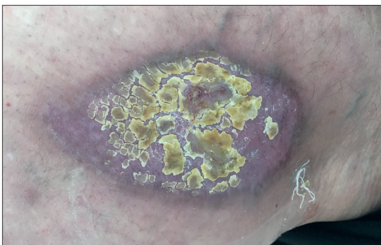
Figure 6. Completely healed wound after 37 days of treatment with Theresienöl.