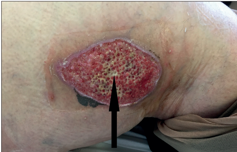
Figure 4. 3 rd degree burn site prior to treatment with Theresienöl.