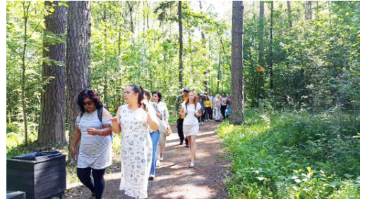
Figure 3. At the Bison Paddock of Pašiliai.

Next stop was at the Bison Paddock of Pašiliai, which is one of the most visited and one of the most impressive places in the region of Panevėžys, where you can see the largest European wild animals - Lithuanian aurochs ( https://www.explorebaltics.eu/sightseeing-places/pasiliai-bison-paddock/ ). Symposium participants had a unique possibility to see aurochs from close. According to aurochs' paddock workers, at this time 24 aurochs live in the paddock, while in the freedom their population reaches more than 200. Most of the participants saw aurochs for the first time. Also, they got acquainted with the ecological-cognitive aurochs' paddock path.