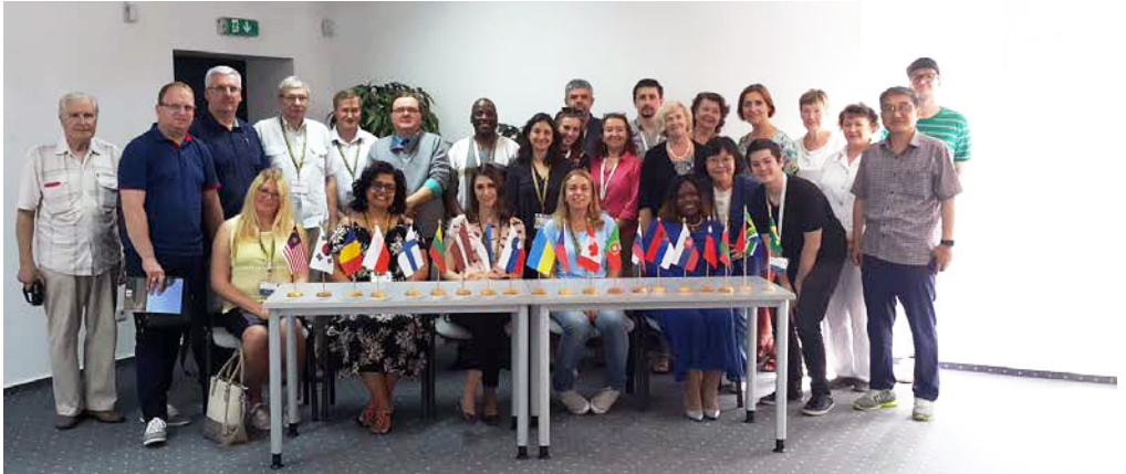
Figure 6. Symposium participants photo.

Before the symposium an article collection was prepared and issued. The full version of the publication is very freely available on the internet at https://www.researchgate.net/publication/333929730_Science_and_technology_education_Current_challenges_and_possible_solutions_Proceedings_of_the_3rd_International_Baltic_Symposium_on_Science_and_Technology_Education_BalticSTE2019 . In the publication, a total of 45 short papers are published, in which various natural science and technology education problems are discussed.