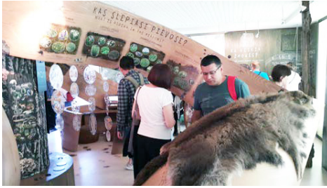
Figure 2. Symposium participants in the Directorate of Krekenava Regional Park.

First of all, the symposium participants visited Directorate of Krekenava Regional Park. Krekenava Regional Park was founded in 1992 in order to preserve the landscape of the mid Nevežis river valley, its natural ecosystem and cultural heritage values, to ensure their management and rational use ( http://krpd.am.lt/en/VI/index.php#a/98 ). The acquaintance was made with the Visitors' Centre interactive exposition, 30 m observation tower was climbed near the Visitors' Centre which reveals a wonderful view of Nevėžis Valley, old hoof-shaped riverbeds, lakelets, and Krekenava town.