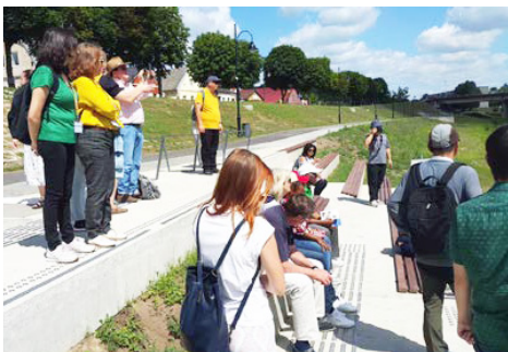
Figure 4. Visiting Kedainiai old town.

Next stop was at the Bison Paddock of Pašiliai, which is one of the most visited and one of the most impressive places in the region of Panevėžys, where you can see the largest European wild animals - Lithuanian aurochs ( https://www.explorebaltics.eu/sightseeing-places/pasiliai-bison-paddock/ ). Symposium participants had a unique possibility to see aurochs from close. According to aurochs' paddock workers, at this time 24 aurochs live in the paddock, while in the freedom their population reaches more than 200. Most of the participants saw aurochs for the first time. Also, they got acquainted with the ecological-cognitive aurochs' paddock path.