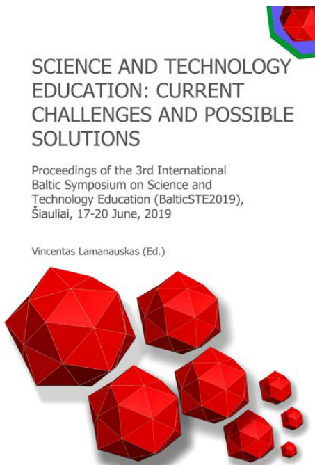
Figure 7. Symposium publication cover.

Before the symposium an article collection was prepared and issued. The full version of the publication is very freely available on the internet at https://www.researchgate.net/publication/333929730_Science_and_technology_education_Current_challenges_and_possible_solutions_Proceedings_of_the_3rd_International_Baltic_Symposium_on_Science_and_Technology_Education_BalticSTE2019 . In the publication, a total of 45 short papers are published, in which various natural science and technology education problems are discussed.