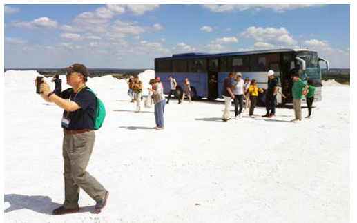
Figure 5. Visiting artificial gypsum mountains.

Having visited the aurochs' paddock, symposium participants went to Kedainiai. Kedainiai is a town located in the very centre of Lithuania. The officially established geographical centre of Lithuania is only a few kilometres away. In other words, Kedainiai