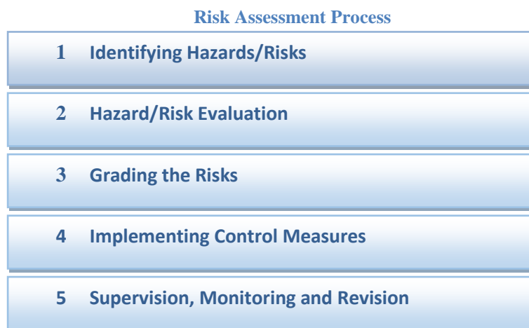
Chart 2: Risk Evaluation Process [3]

Risks analysis and assessment, which is one of the most important steps in the risk assessment cycle, is of great importance both to the process and to the institutions. If carried out by wrong methods or by non-experts, it will not be possible to determine the risks or the levels of these risks correctly. The risk analysis process which must be carried out in accordance to certain standards and methods has been defined by the International Health and Safety Executive (HSE) in 5 fundamental steps [3].