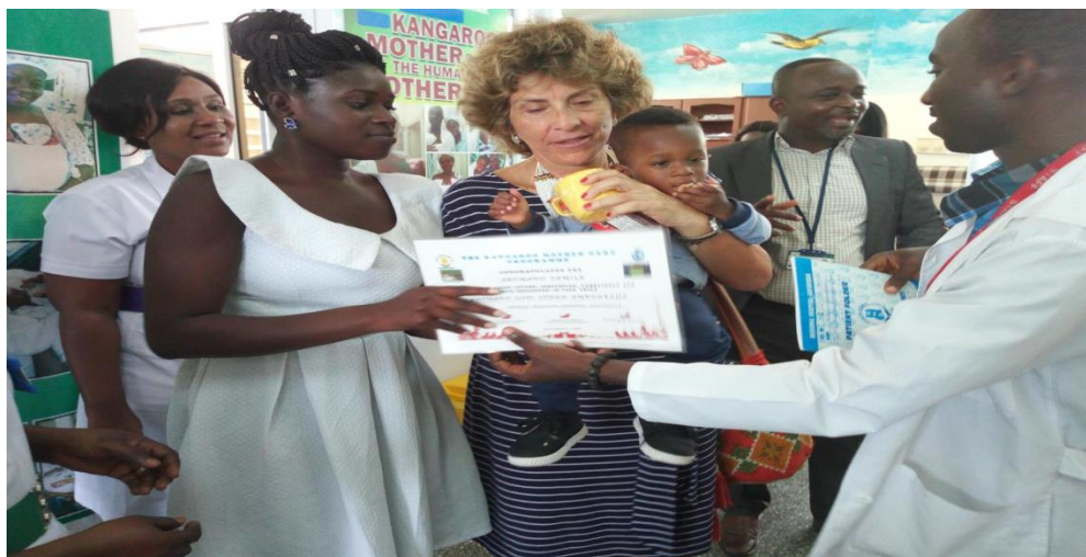
Fig. 5. Visit by the Colombian Ambassador to Ghana to Eastern Regional Hospital

Notwithstanding these achievements, the Eastern Regional Hospital's KMC Excellence Centre hopes to expand KMC coverage from 10 to 100 clinics in Ghana by 2035. It also hopes to access funding opportunities to provide technical and logistical support to all new KMC facilities in Ghana. Also, the centre is working to establish collaborations with researchers, KMC specialist and stakeholders to develop innovations in care.