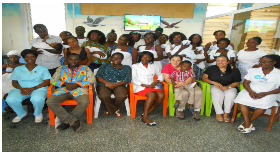
Fig. 3. New KMC Out-Patient KMC Set-up at the Eastern Regional Hospital