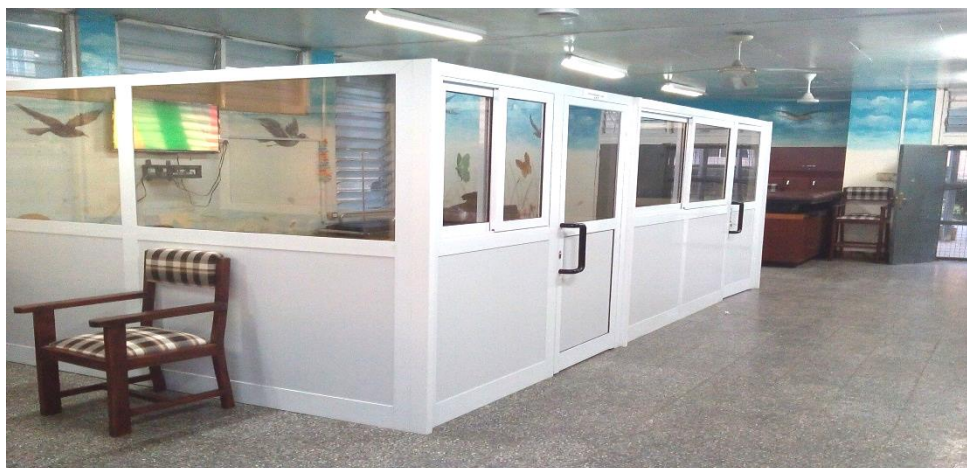
Fig. 2. New KMC Out-Patient KMC Set-up at the Eastern Regional Hospital