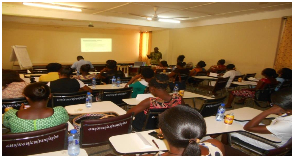
Fig. 4. KMC Workshop for Some Health Workers in Ghana

discharge. The Out-Patient Kangaroo Mother Care clinic provides several multidisciplinary specialist services.