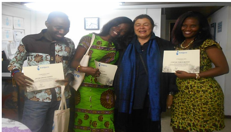
Fig. 1. Participants and Director of Kangaroo Foundation (From left: Psychologist, Medical Officer, Director of Kangaroo Foundation, and Nurse)