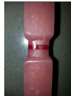
Figure 1. Acrylic specimens with 3mm wax in its narrowest part

Using soft liners: Each group were divided into two subgroups of 9 specimens for better investigation of each subgroup with one type of soft liner. To put and process the liners, a wax (Betadent-Macu-Iran) thickness equal to the thickness of the liner was placed in a 3-mm space (Figure1). Then, to prevent any disturbance in the flasking process, the excess wax was removed using scaple and no 15 blade.