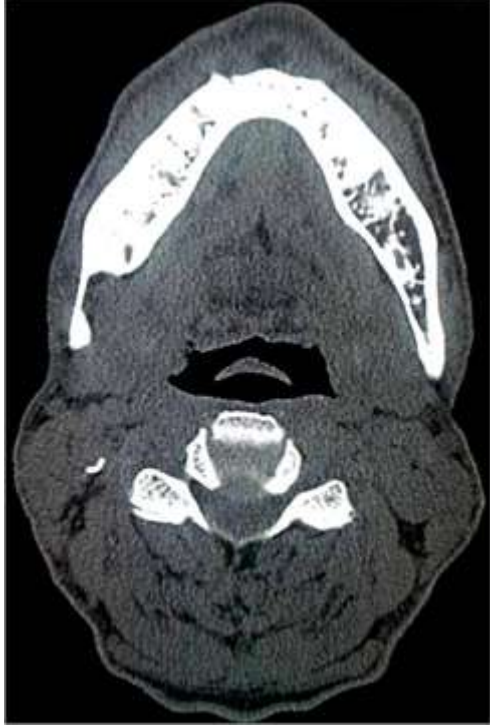
Fig. 3: Axial CT view showing defect