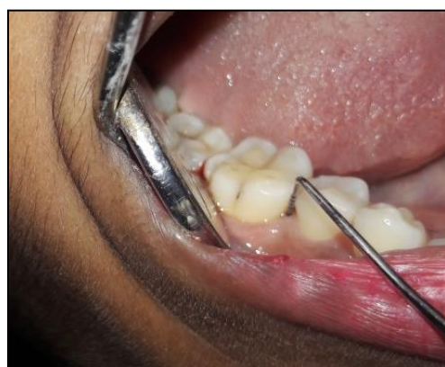
Fig. 1: 4 – 6 mm of probing depth

All the data was collected and analyzed. The statistical analysis was done by statistical software SPSS version 16.0. The descriptive statistic mean and SD of different parameters at different time interval of two groups were calculated, the significance of mean, mean difference of a parameter at 2 intervals was tested by t-test for two independent groups. Since CFU in two groups at pre and post have high standard deviation, so the data for CFU transformed in Logarithm base 10 and log transformed t test has been used. The confidence interval and level of significance were 5% and 95% respectively.