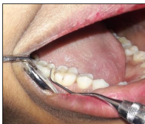
Fig. 2: Collection of plaque sample from the site