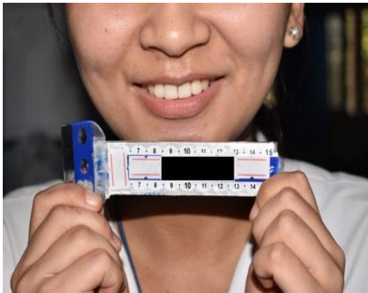
Fig. 1: An example of photograph of the participant during the posed smile, shaded part contains the code number, age and gender of the participant

Parallelism was studied whether incisal edge of maxillary anterior teeth are parallel to upper border of lower lip, or in straight line or in reverse relation. In smile, we also studied whether lower lip touches, does not touch or even covers the incisal edges of maxillary anterior teeth. Number of teeth exposed include whether canines, premolars or molars are seen or not during smile. In assessing the deviation factors (Fig. 2), we checked for presence of midline diastema, multiple gaps, interincisal gap, and canting of upper lip during smile.