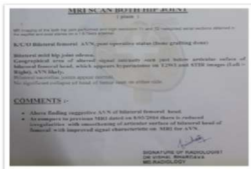
24 week postop. MRI