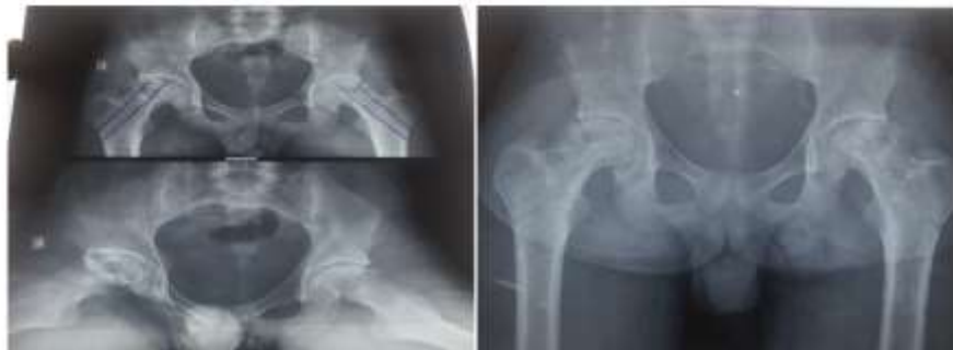
Preop X ray 12 weeks postop X ray