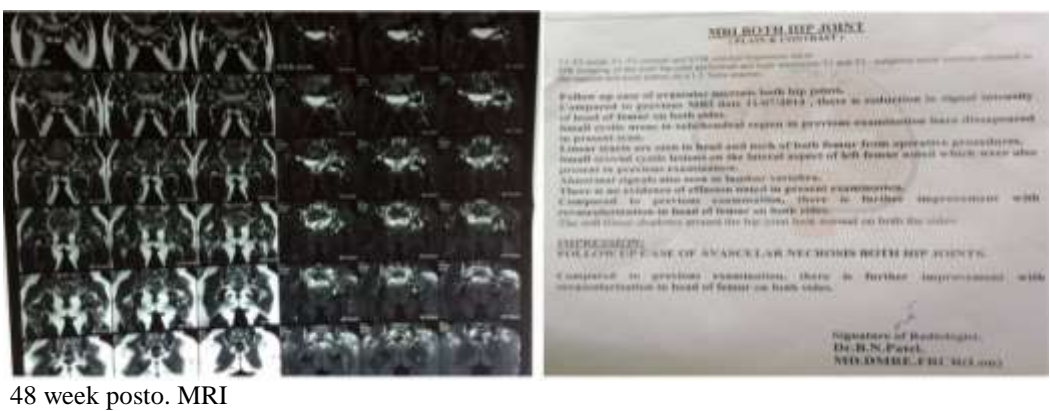
48 week postop. MRI