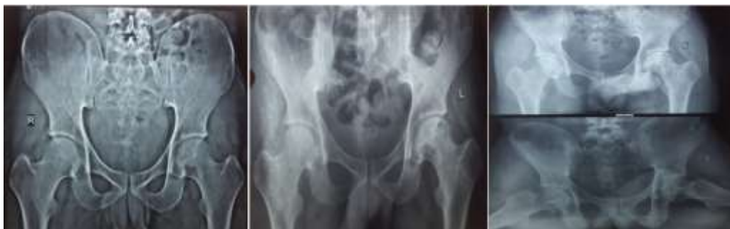
Preop. X ray