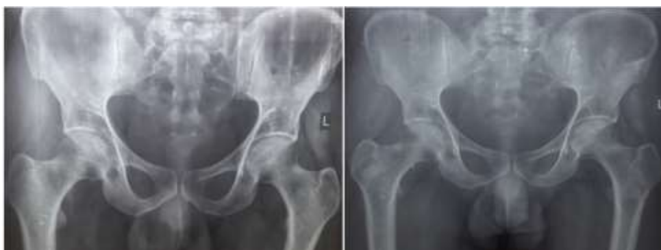
Preop. X ray