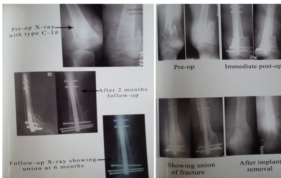
Fig. 1A: Showing Pre-operative X-ray, follow-up X-ray after 2 months and Follow-up X-ray showing union at 6 months; B: Showing Pre-operative X-ray, Immediate post operative X-ray, Union of fracture, and after removal of implant