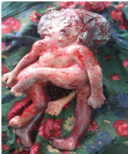
Fig. 1: Delivered cephalothoracophagus conjoined twins

On examination her vitals were – Pulse 120 beats per minute with blood pressure 90/50 mm hg with respiratory rate of 14 per minute with cold extremities. she appeared to be in hypovolemic shock.