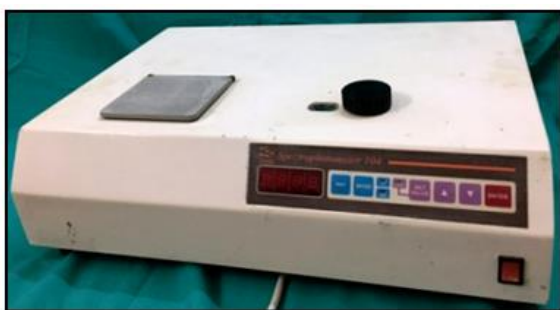
Fig. 1: Spectro-photo meter

symptoms, general condition during admission, blood pressure, pulse, respiratory rate were collected in standardized proforma specially designed for the study and analyzed. Vomit material, gastric lavage contents, blood and urine were collected from each patient as soon as the possible and toxicological analysis was done at Toxicology Laboratory in our Department of Forensic Medicine and Toxicology for further investigation and confirmation of the poison taken. Type of treatment, any antidote, gastric lavage and manner of death was noted. External and internal examination in dead cases was done at Mortuary. Routine viscera and body fluids were sent to Forensic Science Laboratory for chemical analysis. Fig. 1 to 4 showing various instruments used in Analytical Toxicology Laboratory in Department of Forensic Medicine and Toxicology and poisons consumed by patients.