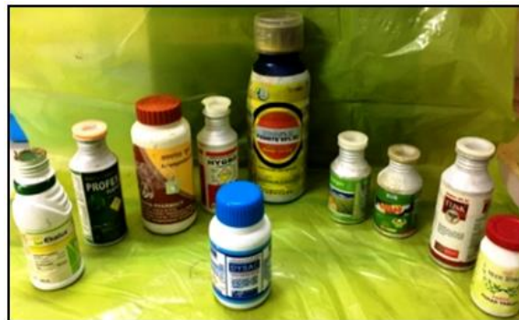
Fig. 4: Various poisons consumed