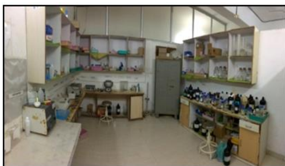
Fig. 3 Analytical toxicology lab