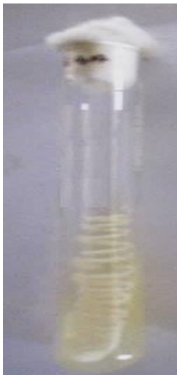
Fig. 3: Candida albicans on SDA