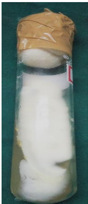
Fig. 4: Fusarium on SDA