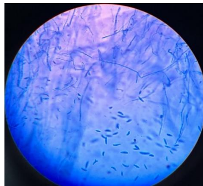
Fig. 5: LPCB mount of Fusarium spp