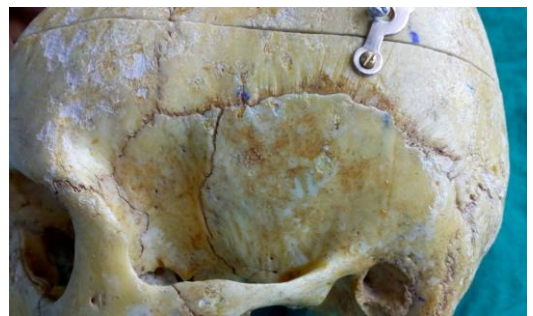
Fig. 2: Sphenoparietal type of pterion