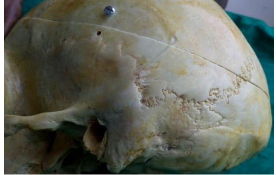
Fig. 5: Type I asterion