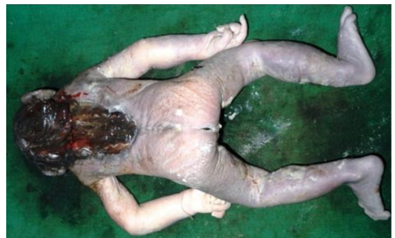
Fig. 4: Craniorachischisis totalis