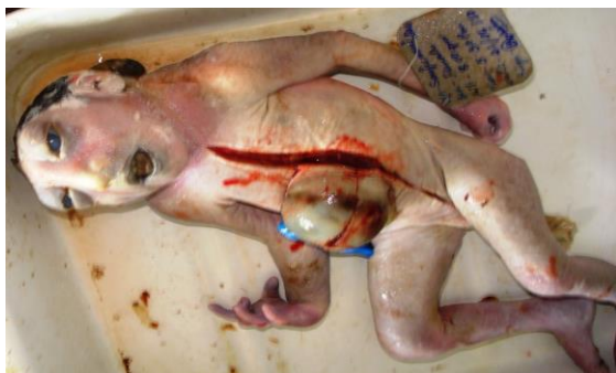
Fig. 5: Anencephaly with occipital meningoencephalocele (cerebellum), omphalocele major, single umbilical artery and contracture right wrist