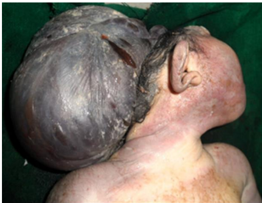
Fig. 1: Anencephaly with occipital meningoencephalocele