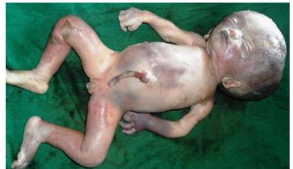
Fig. 3: Hydrocephalus with low set ear, CTEV & syndactyly