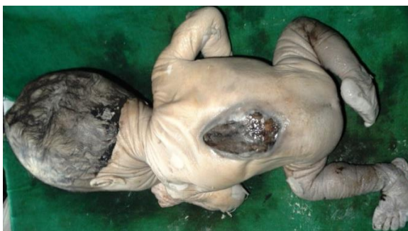
Fig. 2: Spinabifida and meningomyelocele with CTEV