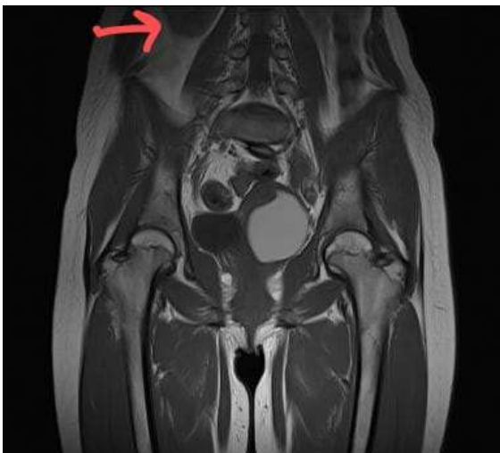
Fig. 4. MR image showing a right renal lower pole in T1 coronal section, but no left kidney.

Based on these findings, the patient was diagnosed as HWW syndrome. Vaginal septum resection was performed as treatment. The oblique vaginal septum in the left half of the vagina, which was located by guiding by pelvic ultrasonography, was cut completely by endoscopic the LigaSure. The left uterine cervix was seen when the hematoma was drained in the left blind hemivagina. She was discharged of hospital on the first postoperative day. One month later, she had normal menstruation.