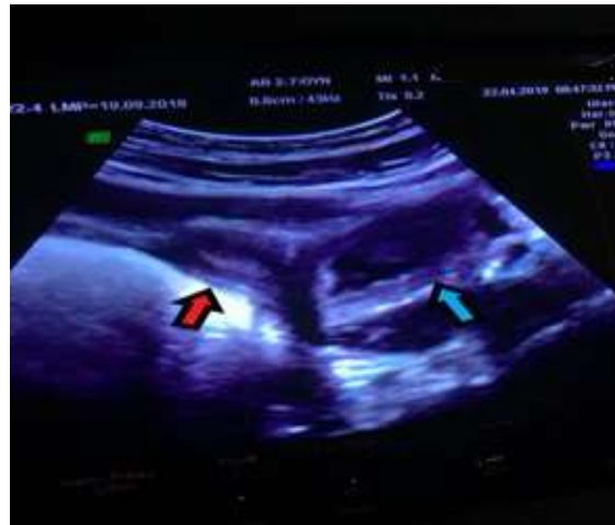
Fig. 1. Pelvic ultrasonography image showing double uterine cavity and 25 mm fluid collection with diffuse low-level internal echo in the left uterine cavity.

found that there was only one cervix and there was no cervico-vaginal hematoma. The intervention was terminated for further review. One week later, magnetic resonance imaging (MRI) revealed two uterus and two cervixes, normal right endometrial cavity signal and thickness, and 17 mm fluid in the left endometrial cavity and consistent with hematometra (Fig. 2).