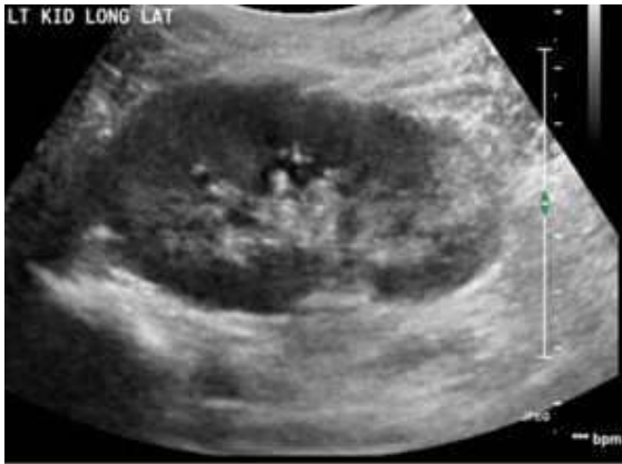
Fig. 3. Ultrasound performed post-operative day 2.